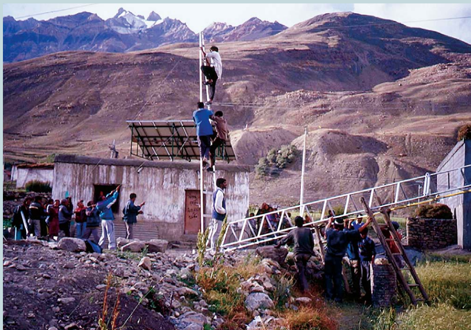
FIGURE 3 Villagers volunteering to set up the windmill in Lossar.

cal and cultural niches. Geographic proximity and commonality of resources and activities can give the cluster constituents the economic benefits of several positive externalities. Forward linkages with regional techno-economic networks can ensure product–market compatibility for these clusters and help them keep pace with ongoing development in the region while contributing to balanced regional growth. Cluster development in the Himalayas can be enabled by CEFs and facilitated to incorporate primary to secondary-level processing as well as suitable packaging and marketing. Area-specific produce such as medicinal plants and crafts can be developed as niche sector products. CEF-powered clusters can thus open up new livelihood avenues that involve less physical drudgery, while