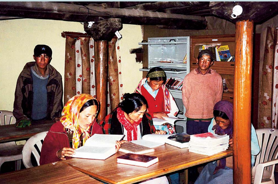
FIGURE 4 Adolescents at the Education Resource Center; both boys and girls can take advantage of the facility.

improving rural incomes. This can greatly improve the quality of life for mountain people, and for mountain women in particular.