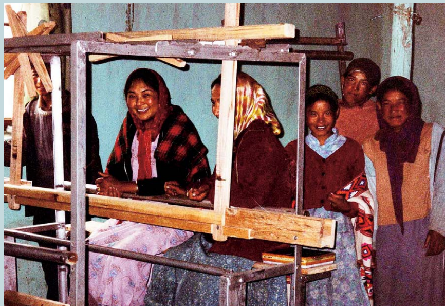
FIGURE 5 Women at the CEF-powered Community Work Station at Lossar.

Gargi Banerji is a development professional with career-spanning interest and work in the Indian