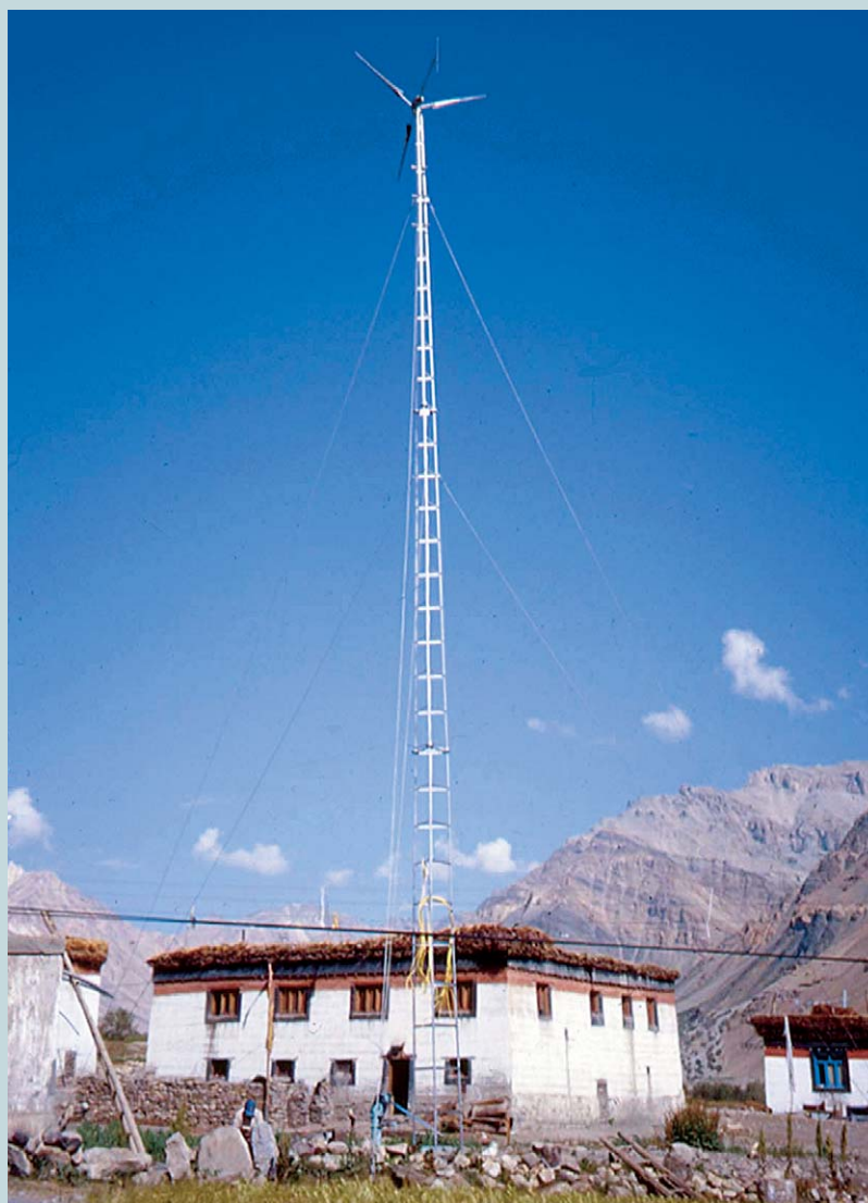
FIGURE 1 The pawan-chakki or windmill built by the Lossarpas.

Energy is neither explicitly recognized as a basic human need nor as a cause of poverty. Yet it is clear that efficient and uninterrupted supply of energy facilitates the forces of development, enables a better quality of life, and builds human capacity. Although efforts have been made to promote renewable energy (RE)